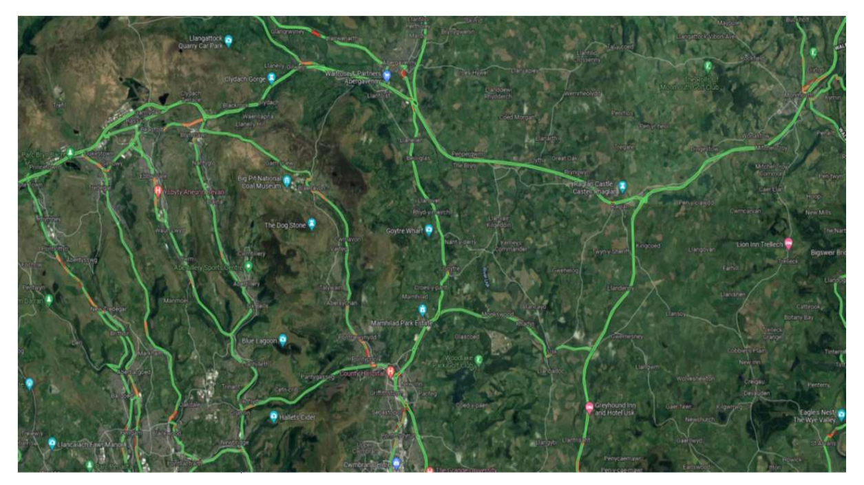
Map 2: Major roads in North Gwent