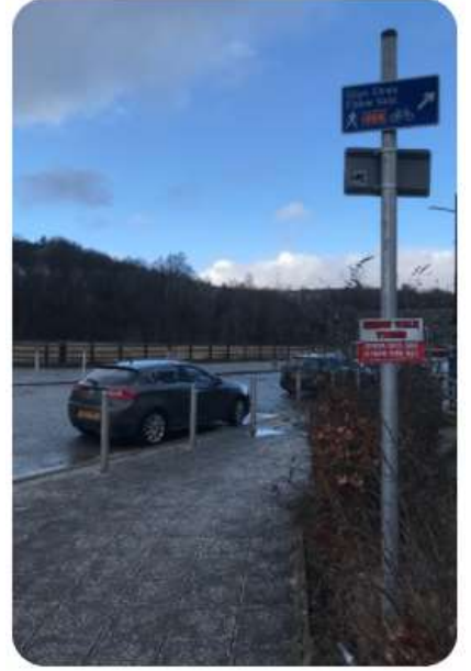
Cycle route opposite the site at Lime Avenue

Coleg Gwent is next to the multi-story car park with the secondary school opposite. The railway station is within 300m. There are accessible cycle routes available close to the cite. Ysbyty Aneurin Bevan hospital is nearby. The Sports and Leisure Centre is opposite with extensive outdoor facilities which with collaboration will further reduce the site size requirements.