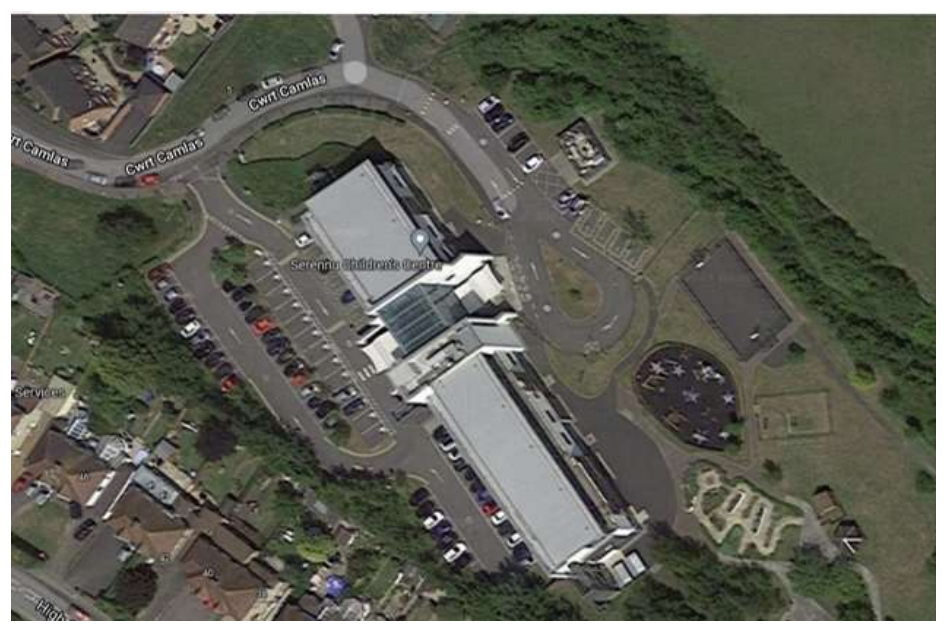
Map 3: Serennu Children's Centre in Newport

In order to assess the size of the site required for the Centre reference has been made to the 'Serennu' site in Newport.