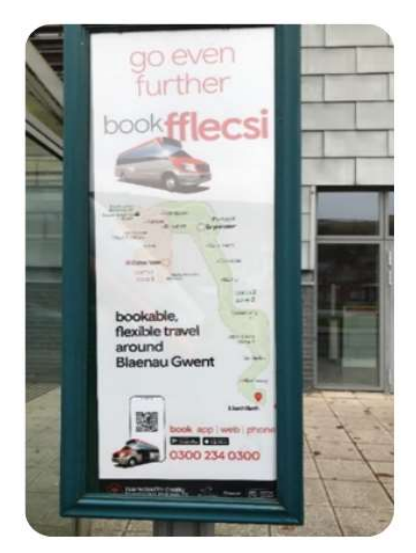
Fflecsi bus stop outside Ebbw Vale Leisure centre

The bus network in North Gwent tends to link the major towns. A plan of the Monmouthshire network can be found in Appendix 2. The main routes are as follows: