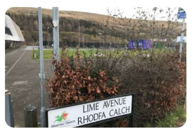
Ebbw Vale leisure centre with extensive outdoor facilities opposite site RES KNL

With collaboration, it will give the potential for after-hours leisure activities to be run seamlessly between the school and the new Centre with the potential to assist parents to extend their working hours, etc. Collaboration with the Education Department would ensure no duplication of facilities, with no loss in service provision