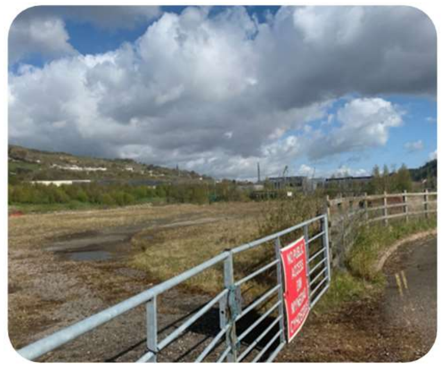
Site Res F adjacent to Pen-Y-Cwm school

This site is also located on the 'Works Site' in Ebbw Vale. It is adjacent to the Pen-Y-Cwm special school (see above).