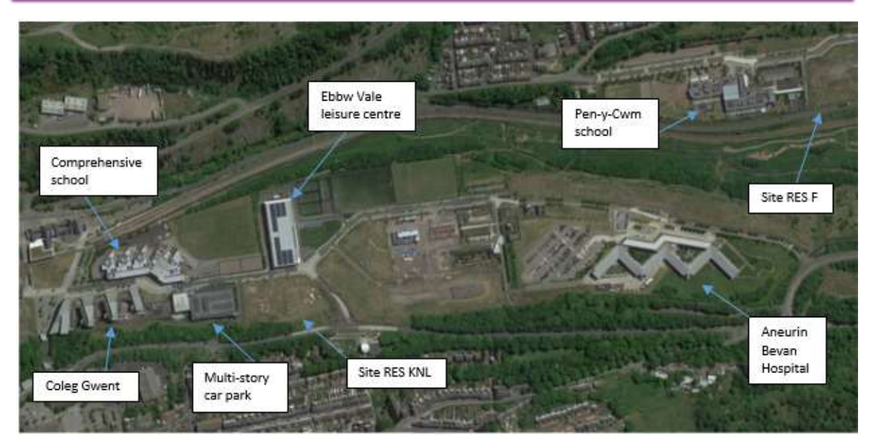
Map 4: Ariel image of the Works Site in Ebbw Vale on which both top sites are located