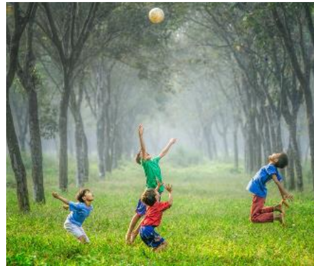
Asking a friend to join your game