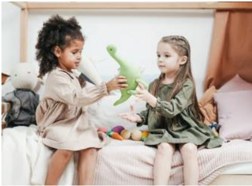
Sharing my toys

INTERACTIVE TIME: Now it's over to you... use these visual cards to help your child to understand what makes a good friend with these visual cards. There is also a blank card for them to put their own ideas about what makes a good friend. You can cut these out and use again and again.