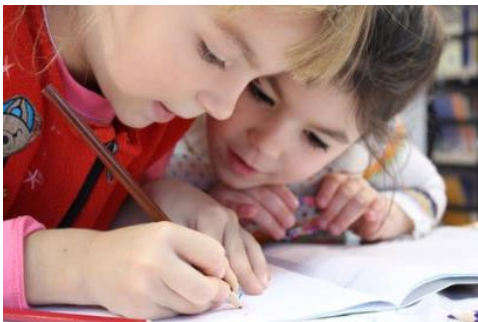
Helping a friend who is stuck with their work